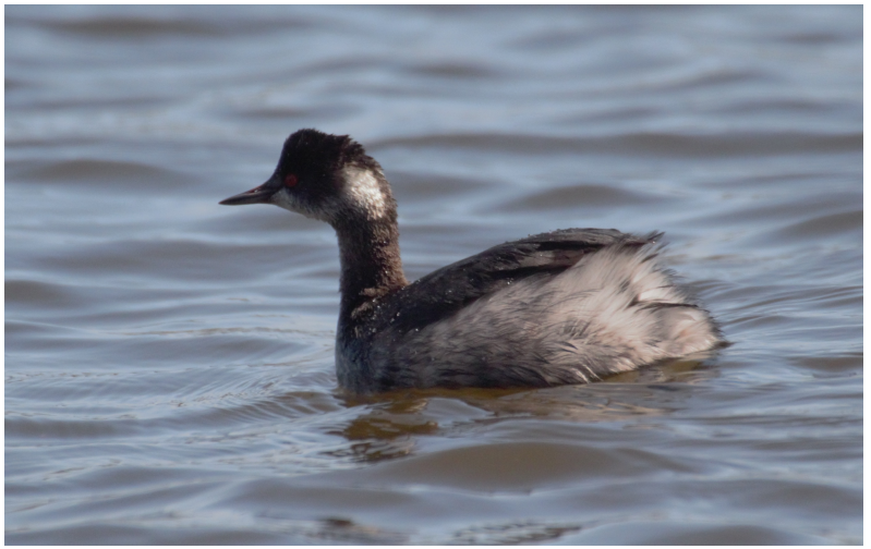
IMG_9203 Eared Grebe (4).jpg