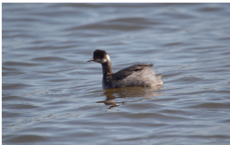
IMG_9199 Eared Grebe (2).jpg