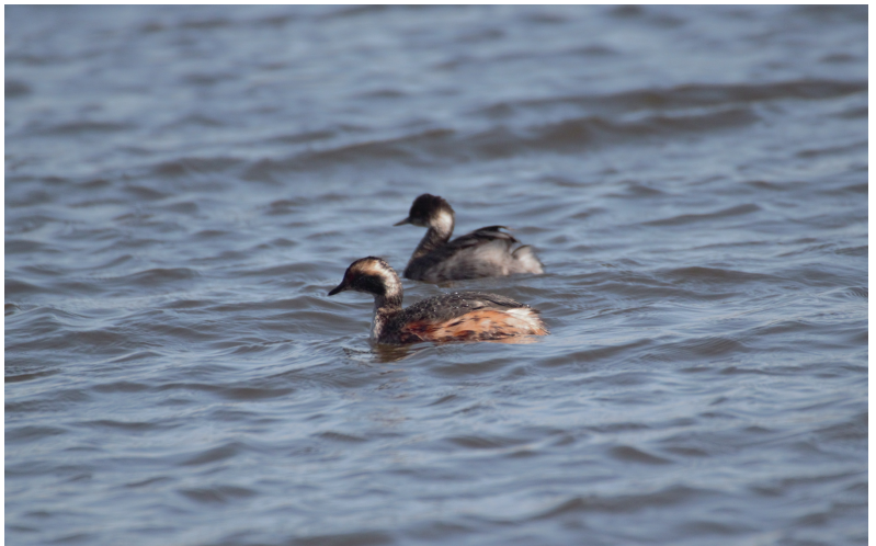
IMG_9240 Comparisaon Grebes (4).jpg