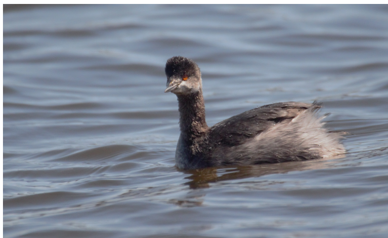
IMG_9198 Eared Grebe (2).jpg